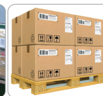
电商物流 E-commerce logistics