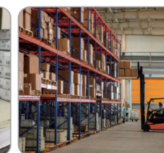
物流货物 Logistics cargo