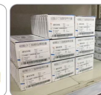
药品外包装贴标 Labeling of Drug Packaging