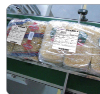
食品外包装贴标 Labeling for food packaging